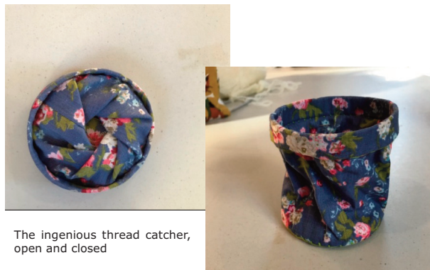
The ingenious thread catcher, open and closed

Carlbeck Christmas Craft Fair: Saturday 10 November, starting at 10am. This is your opportunity to browse a wide array of high quality original and individual crafts which make unique Christmas presents; while there you can also partake of the usual tasty home-made refreshments and do remember to buy a ticket for the super raffle which always includes crafts made at Carlbeck. Come along and sort out your Christmas present list early.