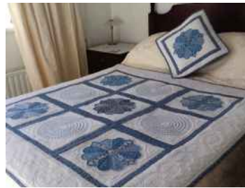
The project that started as a cushion and grew to include a beautiful matching quilt! By Kathleen Shield