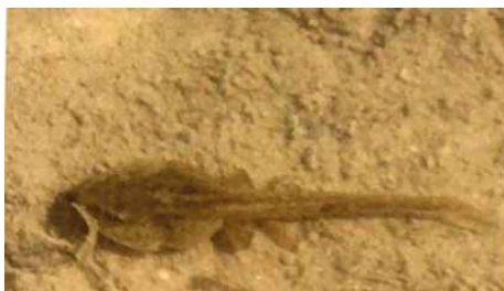
Squillions of tadpoles all over Teesdale and North Stainmore have now matured into frogs, including those in Mary Wilson's garden pond