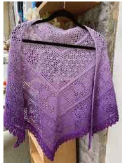
Ruth Cragg's crochet shawl