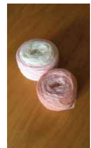
Val Metcalf's Fellview fibres spun for lace work and hand dyed plus cushion and socks