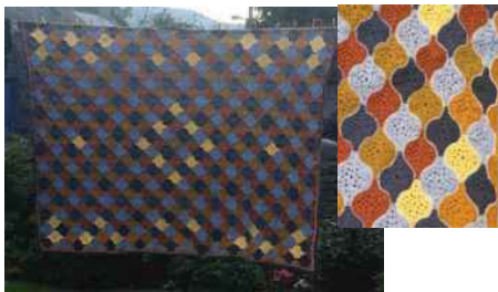
The Spinners at work and play