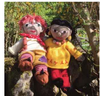
Libby Thompson's knitted dolls