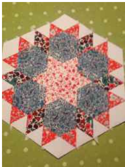
The final block is complete for June Dent's Laura Ashley 'block of the month' quilt. She just needs to assemble the quilt now and we're all looking forward to seeing the finished article.