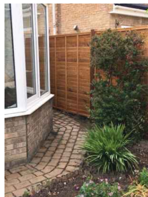
Avril Simpson's new fence