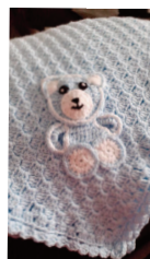
Crochet baby blankets