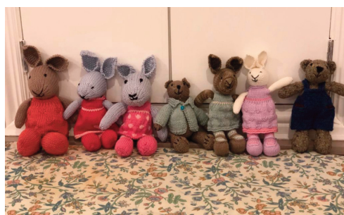
Toy making with the Knitting and Crochet Guild