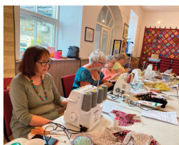
Overlocking for the more confident