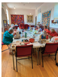
Overlocking for the terrified

Carlbeck crafters have had a busy start to the year. Here are a few examples of their work.