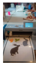
The new Machine Embroidery group with their dye cutter